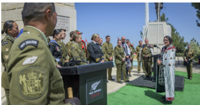
Hon. Meka Whaitiri at Chunuk Bair, Gallipoli

As the dawn service was held, we watched the sun come up over the beach. It was sobering and impressive — and I couldn't help but marvel at the bravery of the Kiwi soldiers, 107 years ago, who had streamed on to the land and up the sheer hills that towered in front of them.