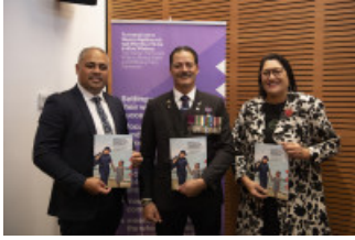
Hon Peeni Henare, Willie Apiata VC, and Hon Meka Whaitiri

Minister for Veterans Meka Whaitiri welcomed the resource. “I’m impressed with the hard work and dedication of so many in the sector who’ve made this Framework happen” she said. “What they’ve produced is a great guide to the needs of veterans, and how best to improve their mental health and wellbeing — and also that of the families and whānau who support them and help to shoulder their burdens.”